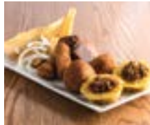
LATIN CAFE 2000 SAMPLER

CLASSIC PORK TAMALES WRAPPED IN CORN HUSK 3.99