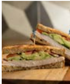
TURKEY AVOCADO SANDWICH