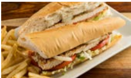
SANDWICH DE POLLO

TUNA SANDWICH CUBAN BREAD, TUNA SALAD, LETTUCE & TOMATO 6.59