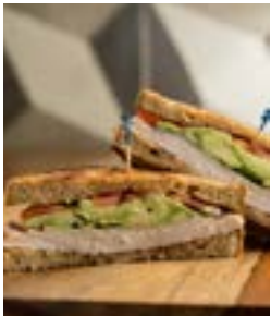
TURKEY AVOCADO SANDWICH